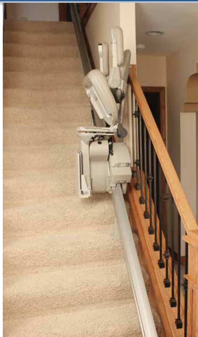
Compact design for open space on stairs.