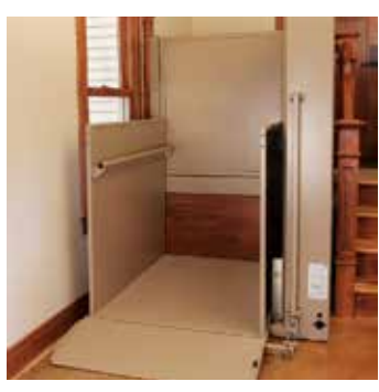
Vertical Platform Lifts