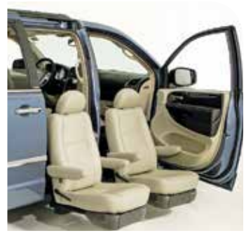
Valet® Signature Seating