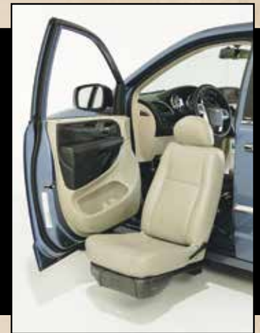
VALET® SIGNATURE SEATING

Founded over 25 years ago, Bruno Independent Living Aids, Inc., is a world-wide manufacturer of accessibility products designed to enhance the lives of those challenged by limited mobility. In pursuing this goal, Bruno is proud to be the only U.S. manufacturer of indoor/outdoor stairlifts, interior/exterior scooter, powerchair and wheelchair vehicle lifts and ValeT® Signature Seating products to be ISO 9001 Certified. This is one of the most stringent, widely-recognized quality standards in the world and your assurance that Bruno is committed to providing you with the highest-quality, most reliable products in the industry. Ask your certified Bruno dealer for details on all Bruno independence products.