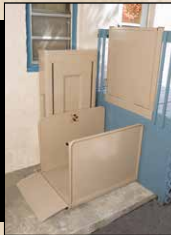
VERTICAL PLATFORM LIFT Model VPL-3100