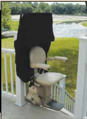
OUTDOOR ELITE Model SRE-2010E The only 400 lb/181.8 kg capacity outdoor stairlift... an INDUSTRY EXCLUSIVE!

Home accessibility solutions and automotive products